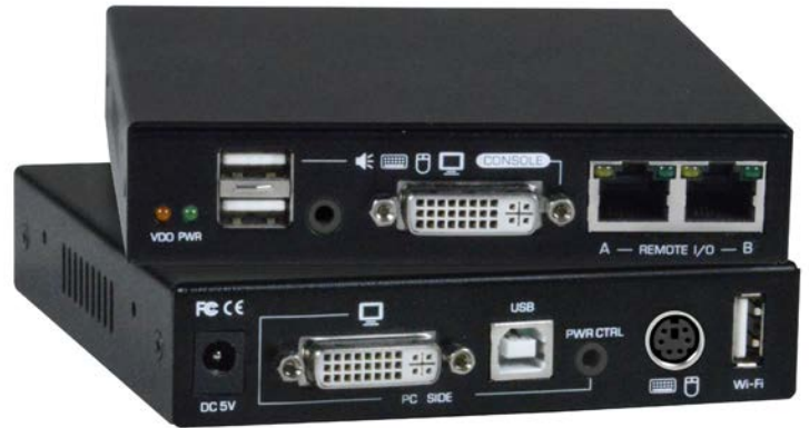
INTERMUX-KVMDUPIP (Front & Back)

The INTERMUX™ DVI USB KVM on IP™ device is used to control one or many computers locally at the server site or remotely via the Internet using a standard browser. Securely gain BIOS level access to systems for maintenance, support, or failure recovery over the Internet. Communication is secure and can be used in conjunction with a KVM switch for multiple-server access.